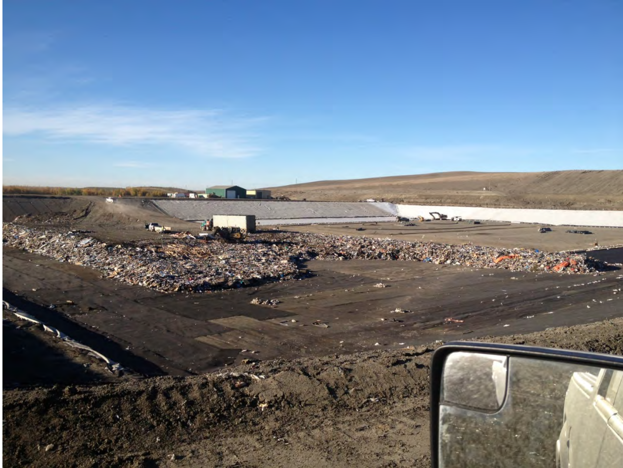
STAGE 5 CELL – SEPTEMBER 2013

Innovative Solutions for a Changing World