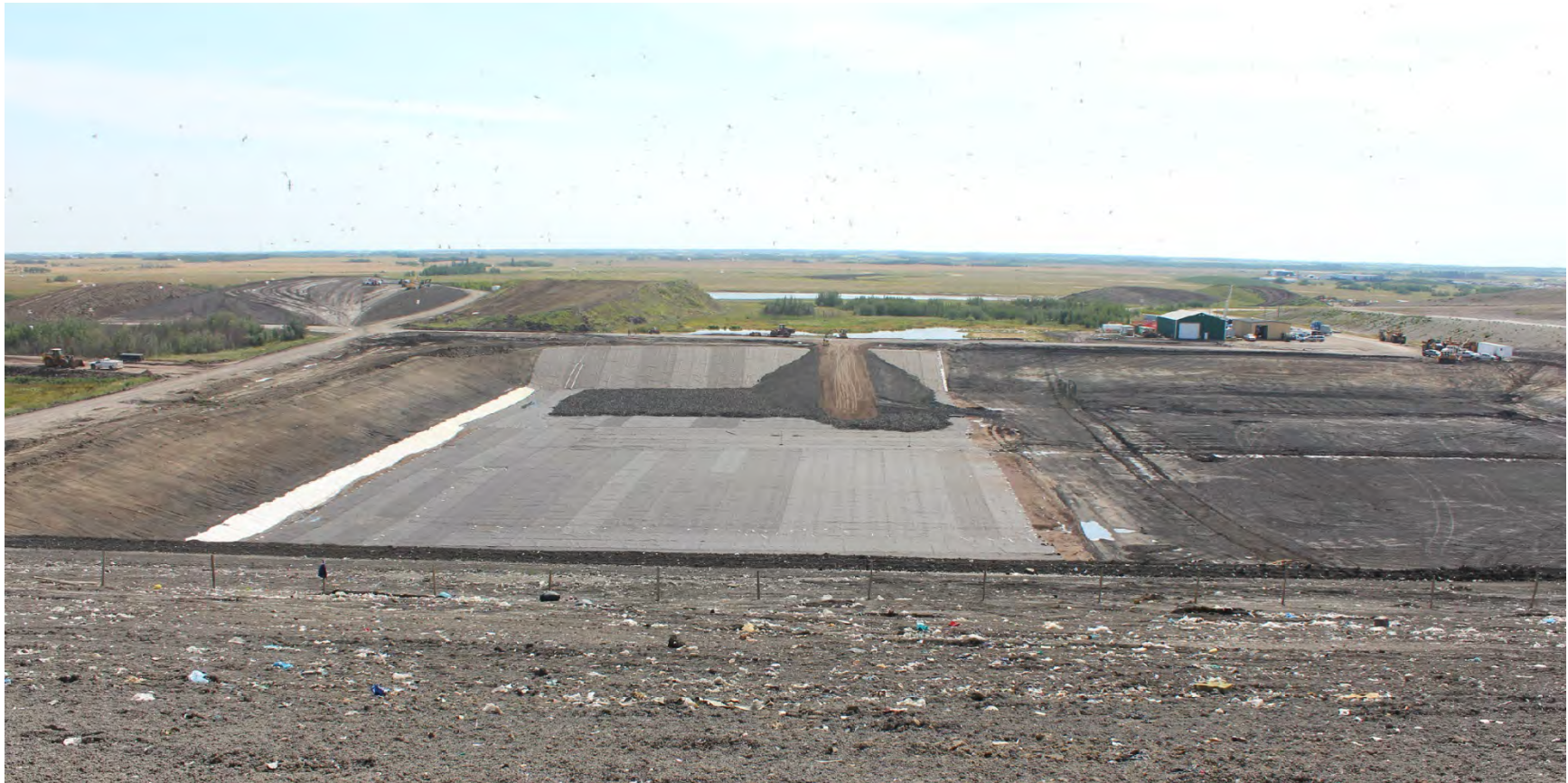
STAGE 5 CELL – AUGUST 2013

Innovative Solutions for a Changing World