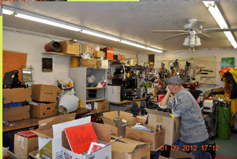
Old Sorting Room