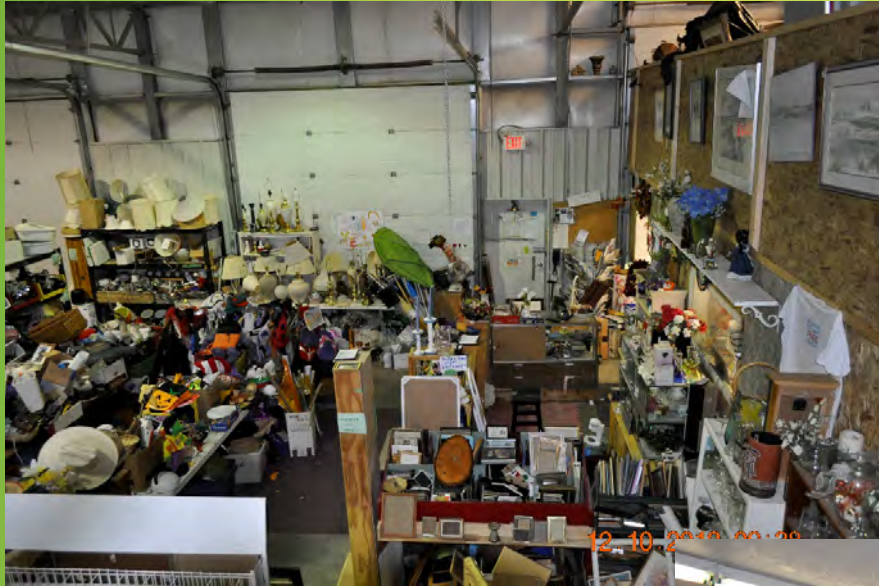
Floor- View from storage area